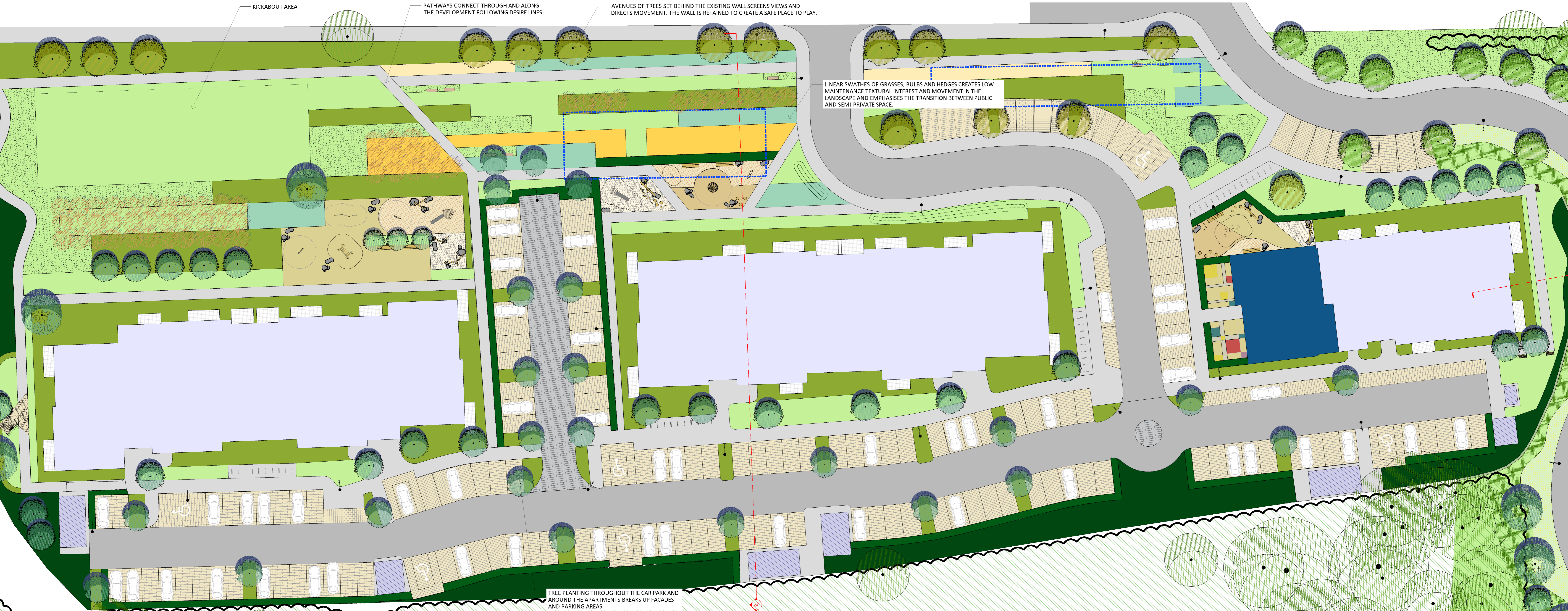
ACADEMY PARK, PLAN VIEW SC. 1:200